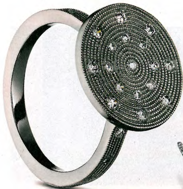
1st Place, Platinum Distinction Brian Sholdt, Fern Finish Platinum Ring Platinum, iridium, diamonds