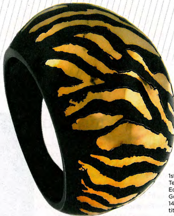
1st Place, Visionary Technical Solution Edward Mirell, Safari Gold & Black Ti Ring 14k gold, black titanium