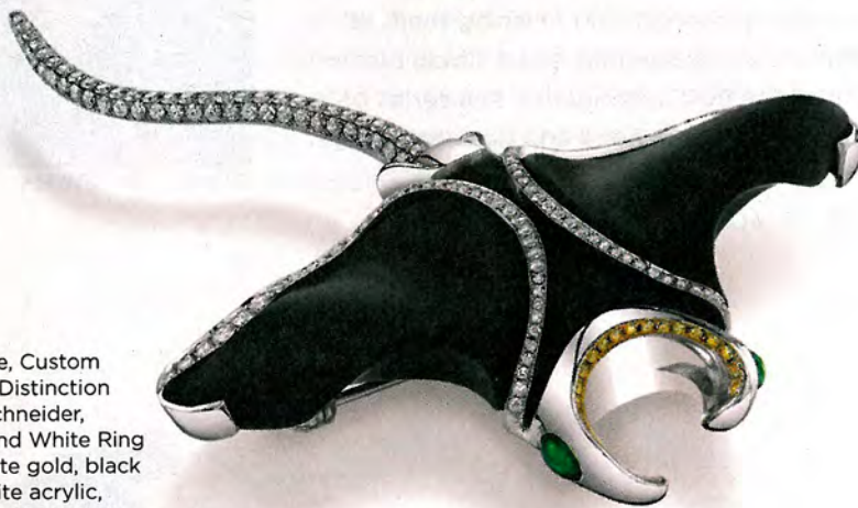
1st Place, Custom Design Distinction Mark Schneider, Black and White Ring 14K white gold, black and white acrylic, magnet, black and white diamonds